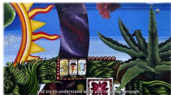
and try to understand what you're going through