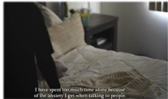
I have spent too much time alone because of the anxiety I get when talking to people.